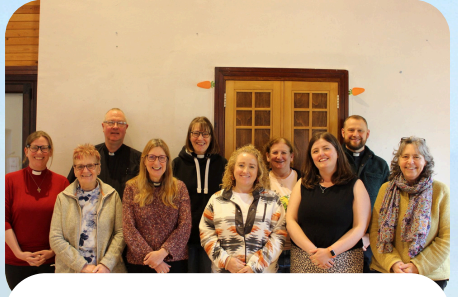
Your Clergy Team